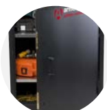
TuffStor Cabinet TSC2