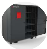
TuffStor Cabinet TSC9