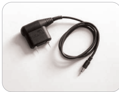
BLD5060 Heavy Duty 2-Pin Probe