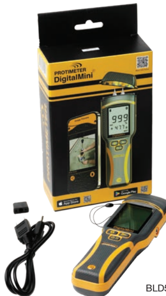
BLD5775 - Digital Mini Standard Kit