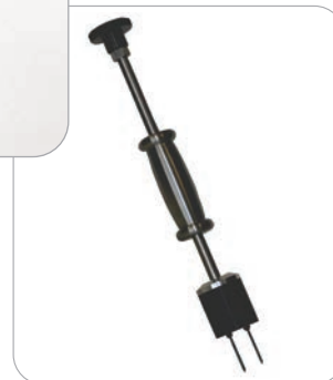
BLD5055 Heavy Duty Hammer Probe