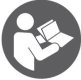
Refer to instruction manual

IMPORTANT: PLEASE READ THESE INSTRUCTIONS CAREFULLY. NOTE THE SAFE OPERATIONAL REQUIREMENTS, WARNINGS & CAUTIONS. USE THE PRODUCT CORRECTLY AND WITH CARE FOR THE PURPOSE FOR WHICH IT IS INTENDED. FAILURE TO DO SO MAY CAUSE DAMAGE AND/OR PERSONAL INJURY AND WILL INVALIDATE THE WARRANTY. KEEP THESE INSTRUCTIONS SAFE FOR FUTURE USE.