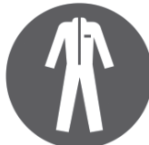
Wear protective clothing