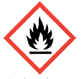
Signal Word. Danger